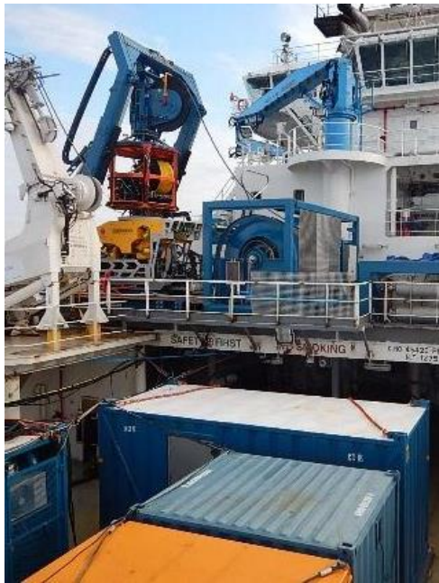
ROV Mezzanine Deck